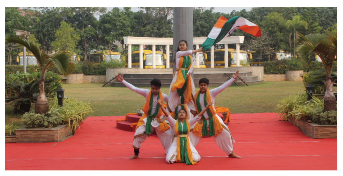
"A Nation's culture resides in the hearts and in the soul of Its people."

The 73rd Republic Day of this glorious nation was celebrated on 26 January at Royal Global School with patriotic fervour and zest among all.