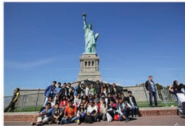
The USA Trip