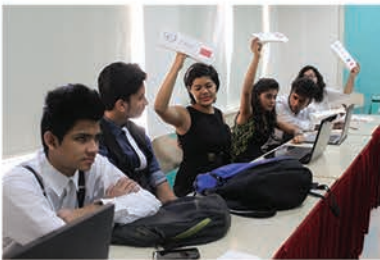
1st RGS MUN