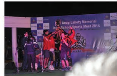
2nd Anup Lahoti Memorial Inter School Sports Meet