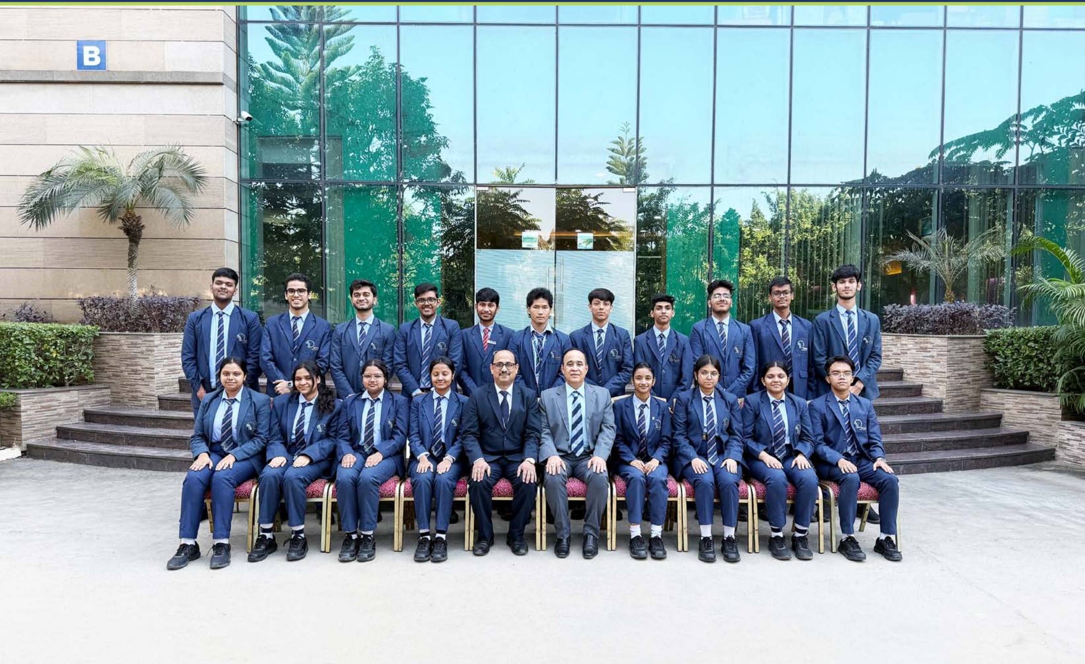
Grade XII-C (Commerce)