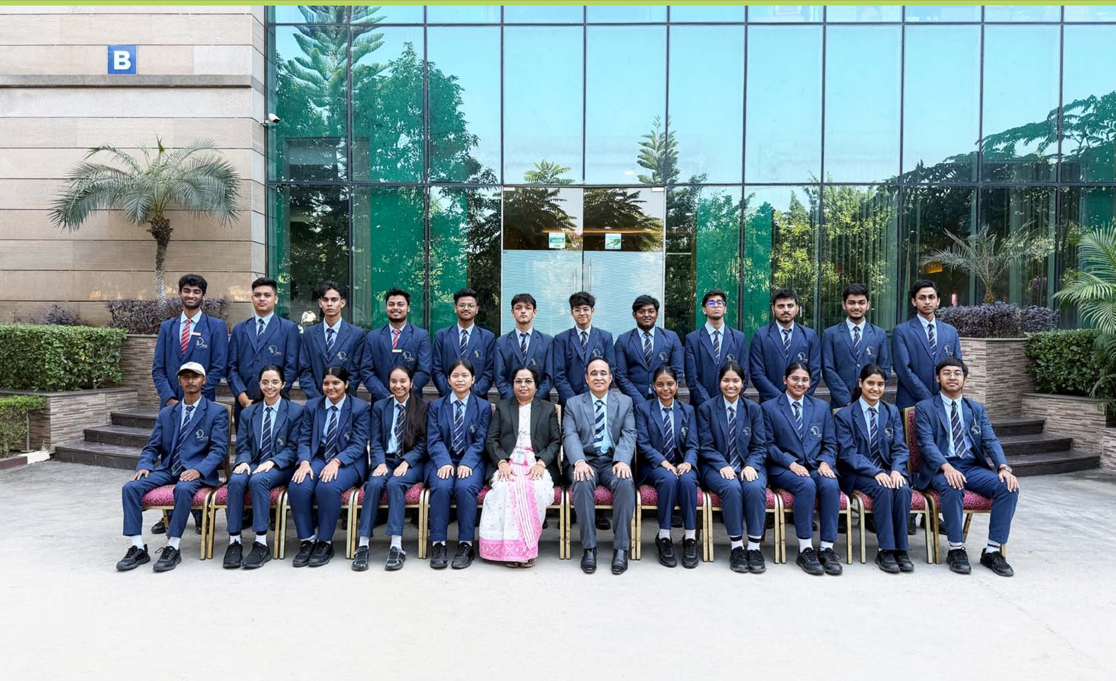
Grade XII-D (Commerce)