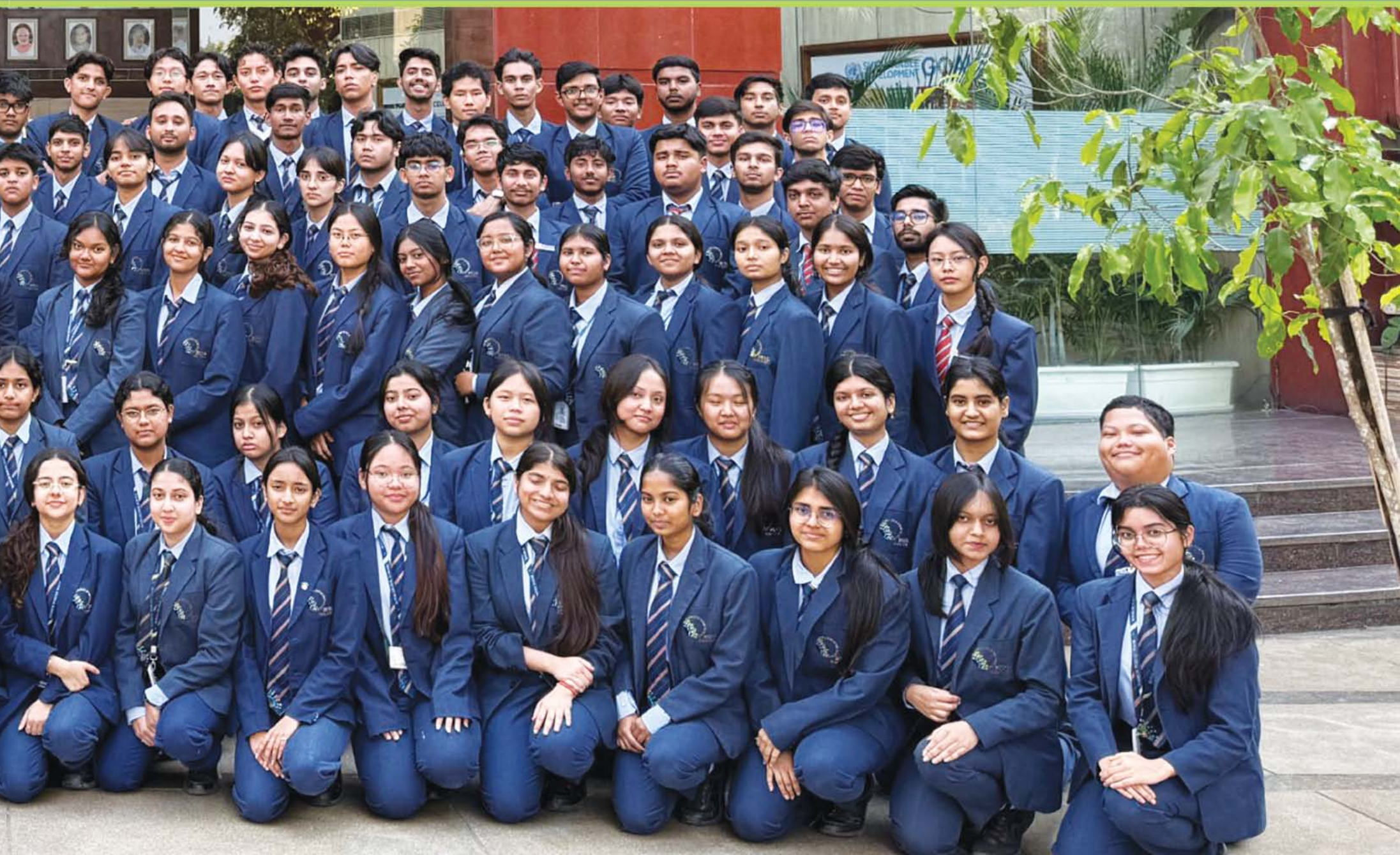
Batch of 2025-26