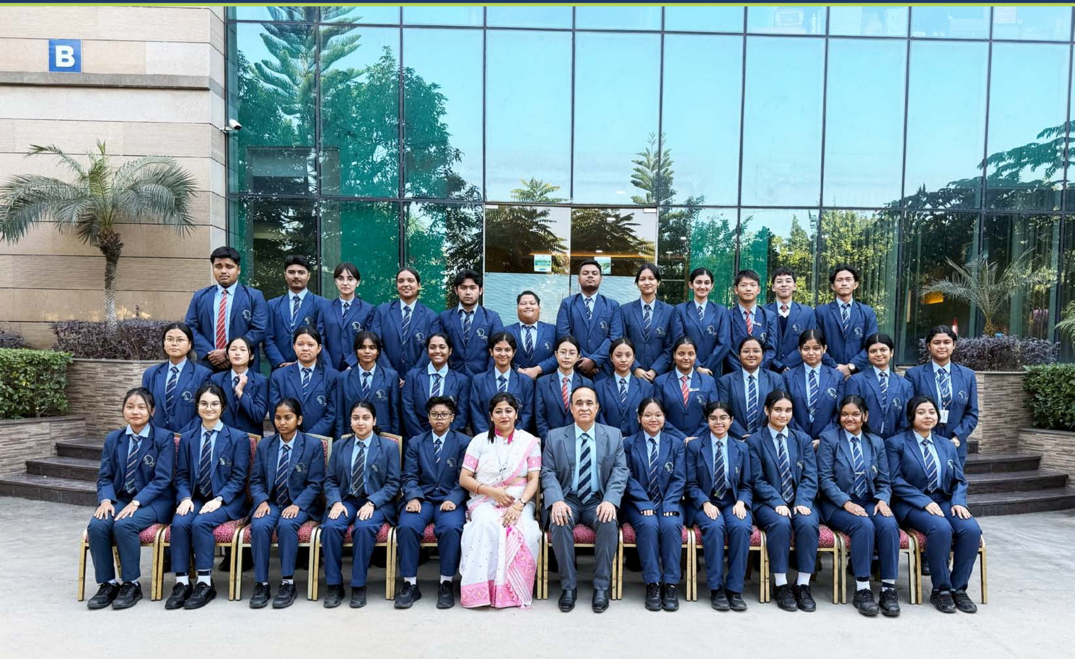
Grade XII-B (Humanities)