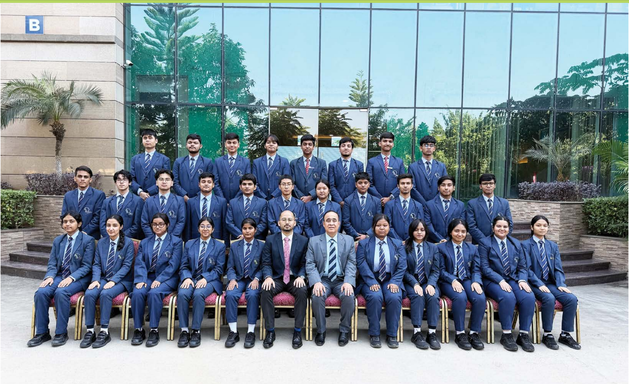
Grade XII-A (Science)