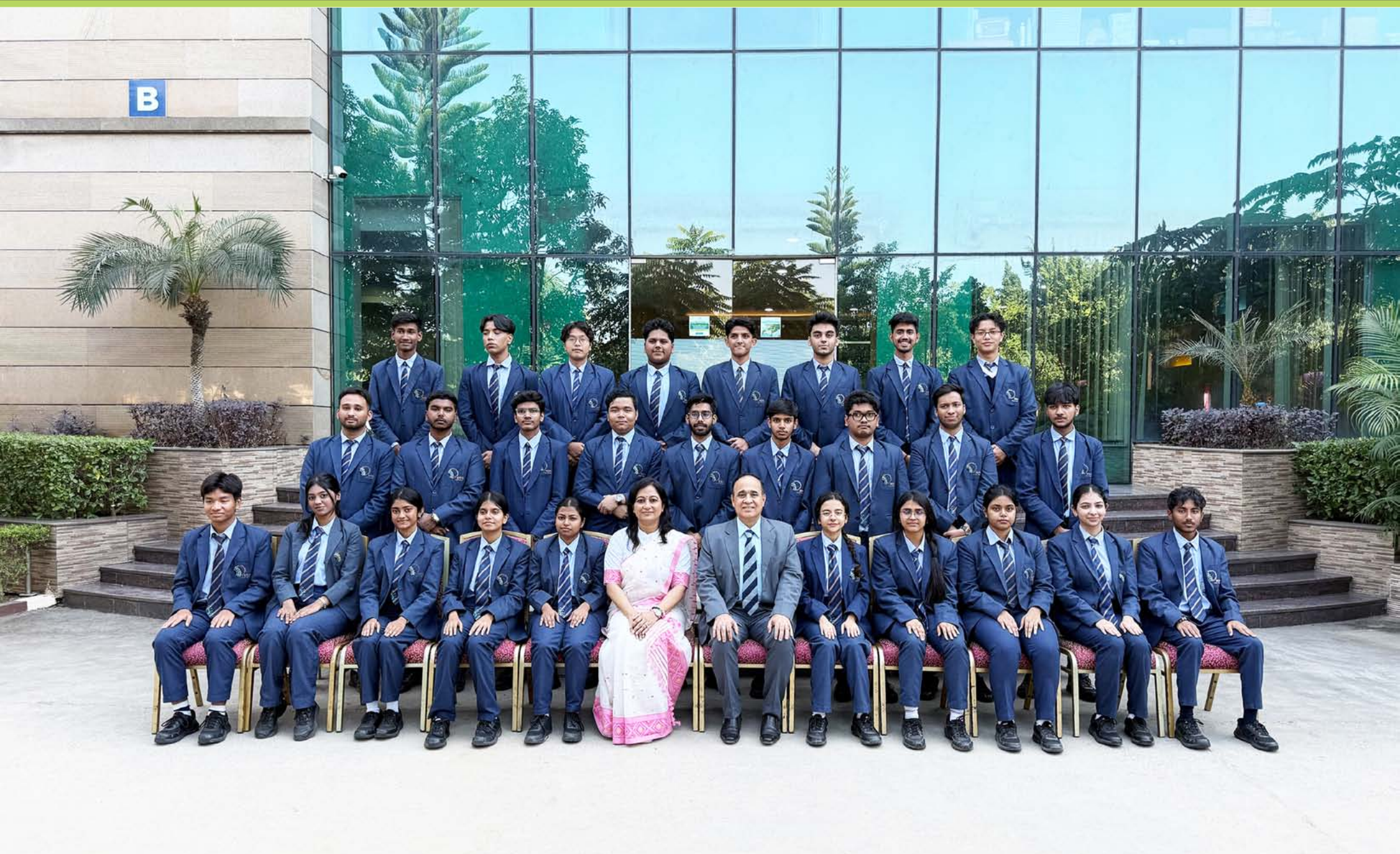
Grade XII-E (Commerce)